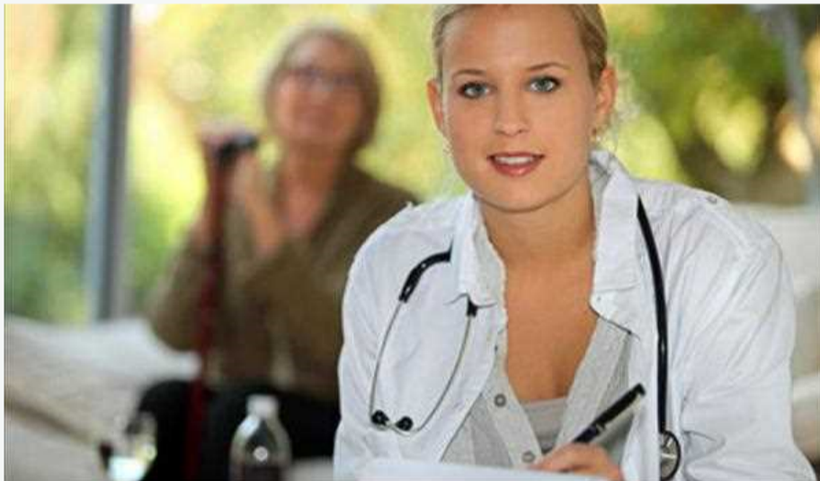
Cough Bronchitis Chronic Cough Phlegm Wet Cough Lungs Bronchitis

Home Remedies Remember, even after you have determined the cause, and your cough persists despite making use of the above-mentioned home remedies, it is recommended that you visit a doctor for further treatment.