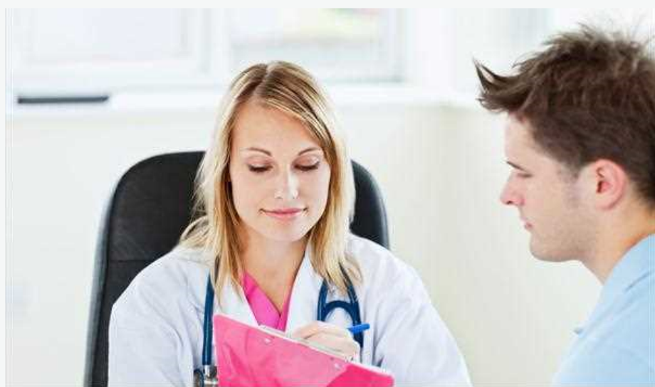
CoughWet CoughLungsCold BronchitisBronchitis RespiratoryDry

Almost all of us have experienced productive cough, which may be because of a common cold, bronchitis, or other respiratory tract infections. Coughing up phlegm is rather a good sign, as accumulation of the same can lead to chest infections and other medical complications. Nevertheless, a chronic cough condition with phlegm that is discolored (yellow, rusty-brown, green, etc.) should not be neglected, as it can be a symptom of some serious lung ailments.