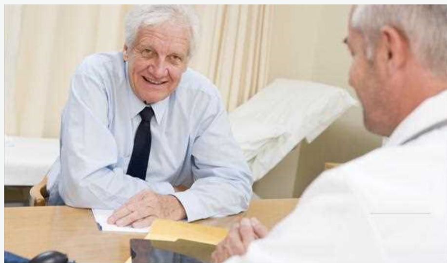
Signs Symptoms Bronchitis